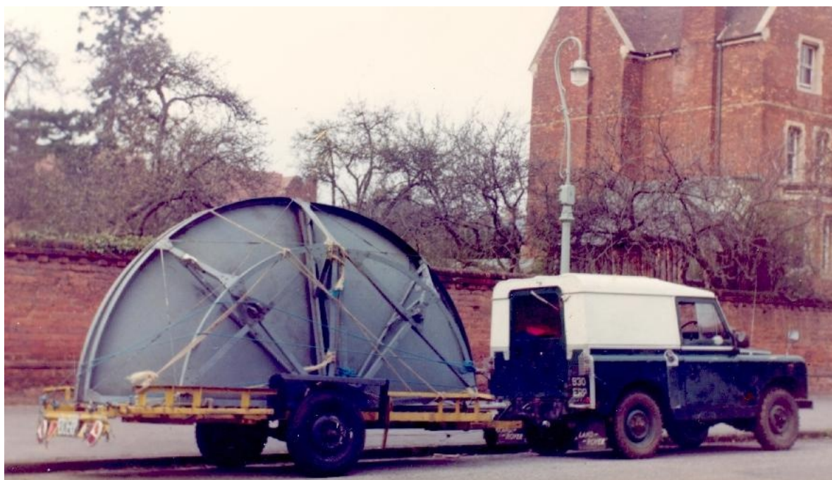
Figure 1 The Dish being taken to Oxford in 1985

This is a brief summary of the FRARS EME system. FRARS had some experience of EME with Yagis on 432MHz and 1296MHz in the early 80s. This is the story of a project that began in 1985 when RSGB was offered a 12ft (3.65m) prime focus dish that had been removed from the 2GHz links on the Post Office Tower, London. It was gratefully received by G3YGF on behalf of FRARS, and was initially taken to G3OUR (Oxford University Radio Society) on G3WDG's road trailer for some unsuccessful tests, Figure 1. In 1989 the 4 quadrants were taken down to Wimborne, Dorset, on a boat trailer.