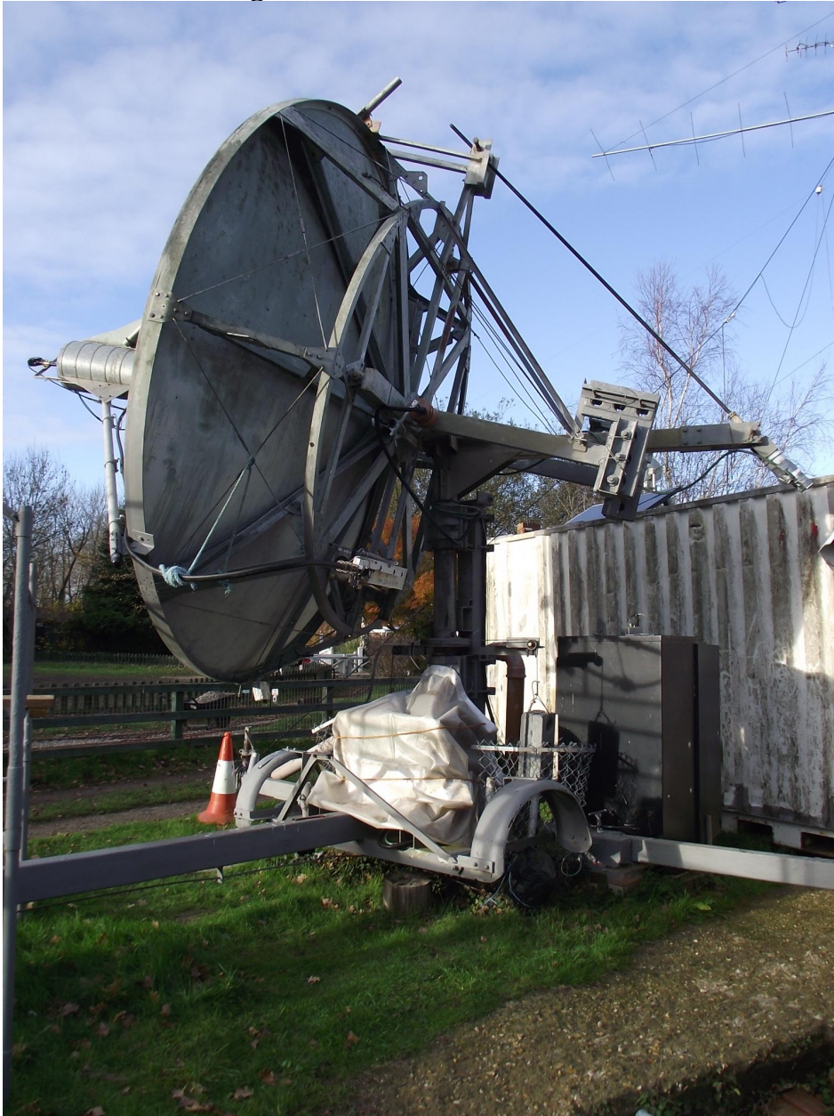
Figure 3 Rear View of the Dish

It is rather heavy at 250kg. This, and a further 250kg of mild steel fabricated mounting, all sit on top of a 6" round steel pipe which is mounted on a large side-and-end thrust race, giving 360 degree Azimuth rotation. It is clamped to the original square section base post on a Strumech versatower trailer.