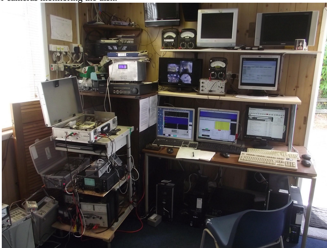
Figure 6 The Operating Position

The operating position is shown in Figure 6. There are currently 4 PCs and 6 monitors at the operating desk, running WSJT, the HB9Q chat facility/the internet, SpectraVue, the dish tracking software, and a split screen display for cameras monitoring the dish.